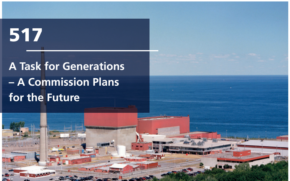
| The James A. FitzPatrick Nuclear Power Plant in Scriba, NY, USA. Exelon Generation will assume ownership and management of operations of the 838 MW boiling water reactor. The operation license of the plant was extended in 2008 for further 20 years until 17 Oct. 2034