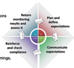
The PDCA cycle.

Lightning- and Overvoltage Protection of Nuclear Power Plants . . . . . 534 Blitz- und Überspannungsschutz von Kernkraftwerken – Nachweisführung der ausreichenden Sicherheit für leittechnische Einrichtungen auch bei Blitzeinschlägen mit extremen Parametern . . 534