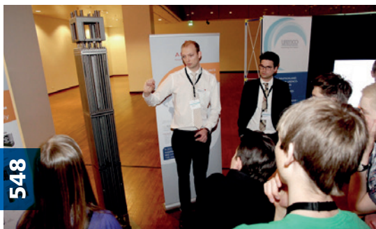
Presentation at the “Nuclear Energy Campus” of the “47th Annual Meeting on Nuclear Technology”

Key Topics | Outstanding Know-How & Sustainable Innovations and Enhanced Safety & Operation Excellence . . . . . 549